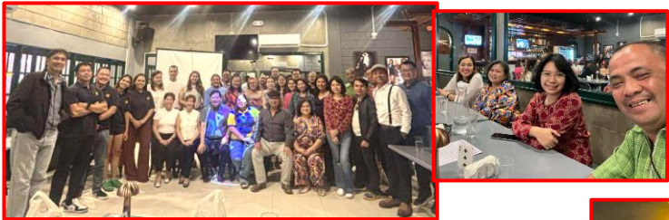
7 th ACOM December 4, 2025 @ Dance Club Studio Davao

December 10, 2025 @ Eskina Lanang Business Park, Davao City